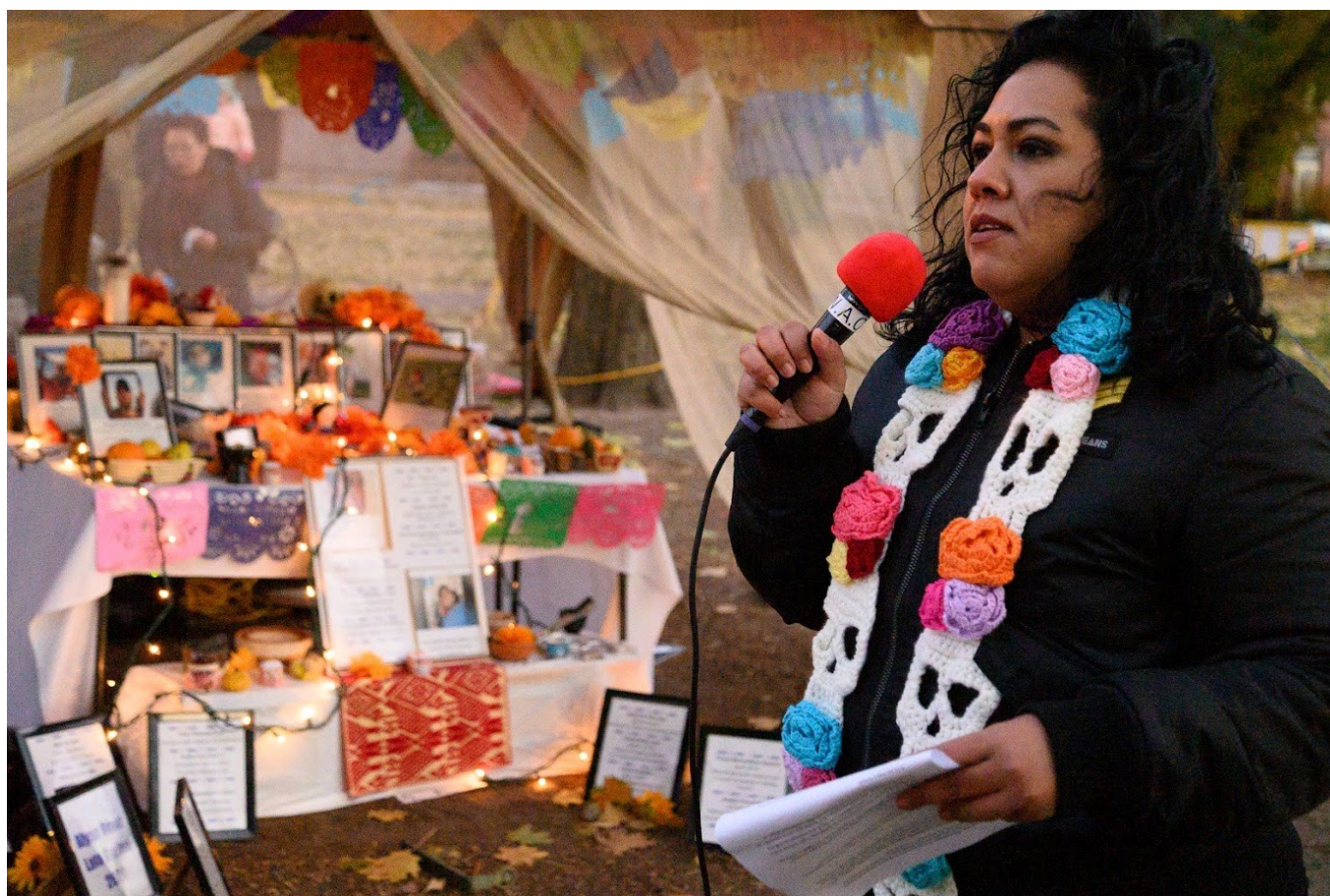
November 1, 2020: Day of the Dead Celebration for Status for All, honouring the migrant farmworkers who died of COVID-19. Thank you to the staff and allies who contributed their photos.