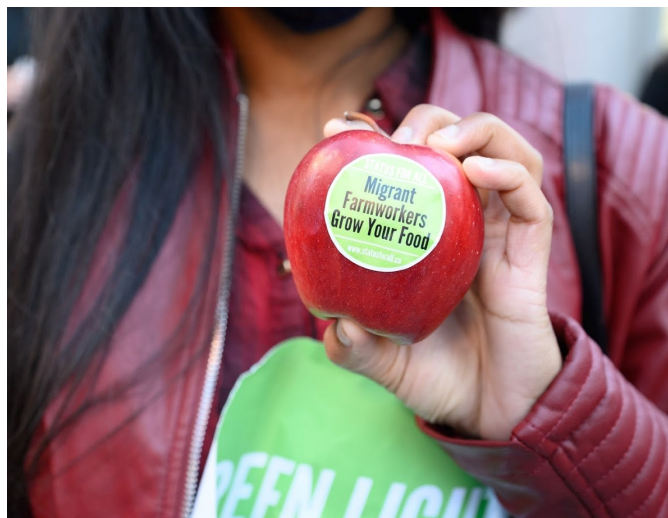
September 20, 2020: Green Light - Status for All action at Yonge & Dundas in Toronto

A critical campaign launched in 2020 was Status for All. WAC is a member of the Migrant Rights Network, which is a national coalition of migrant worker groups who have come together to challenge Canada's unfair immigration laws. Energetic and creative actions took place all across the country. WAC members worked together with our migrant group allies to send strong messages to the Federal Immigration Minister Marco Mendicino, participated in a car caravan to support farmworkers in Niagara, and joined powerful actions in downtown Toronto. Our organization has an important role to play in supporting workers in Ontario whose immigration status is being used by employers to take advantage of them on the job. We will not stand for this injustice!