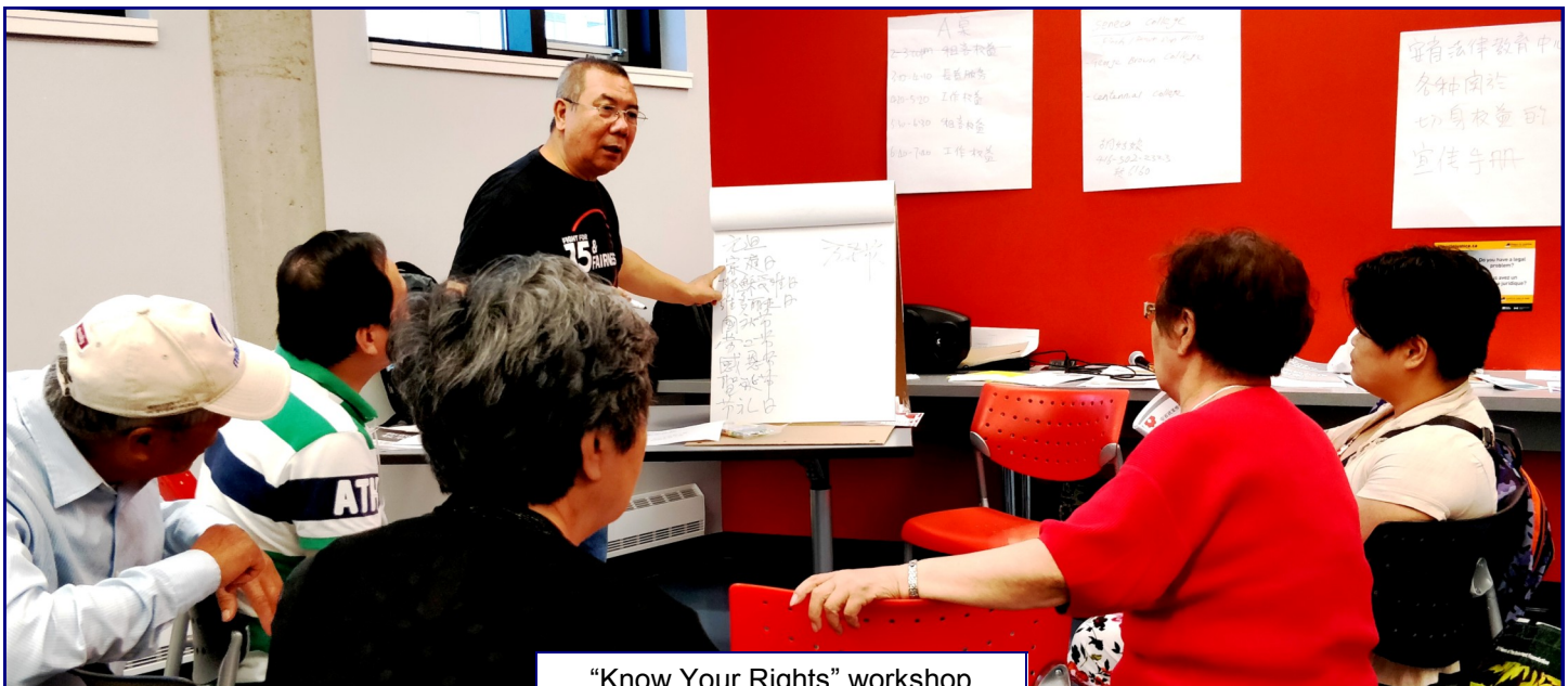
“Know Your Rights” workshop

11,980 Booklets and factsheets distributed on workers' rights