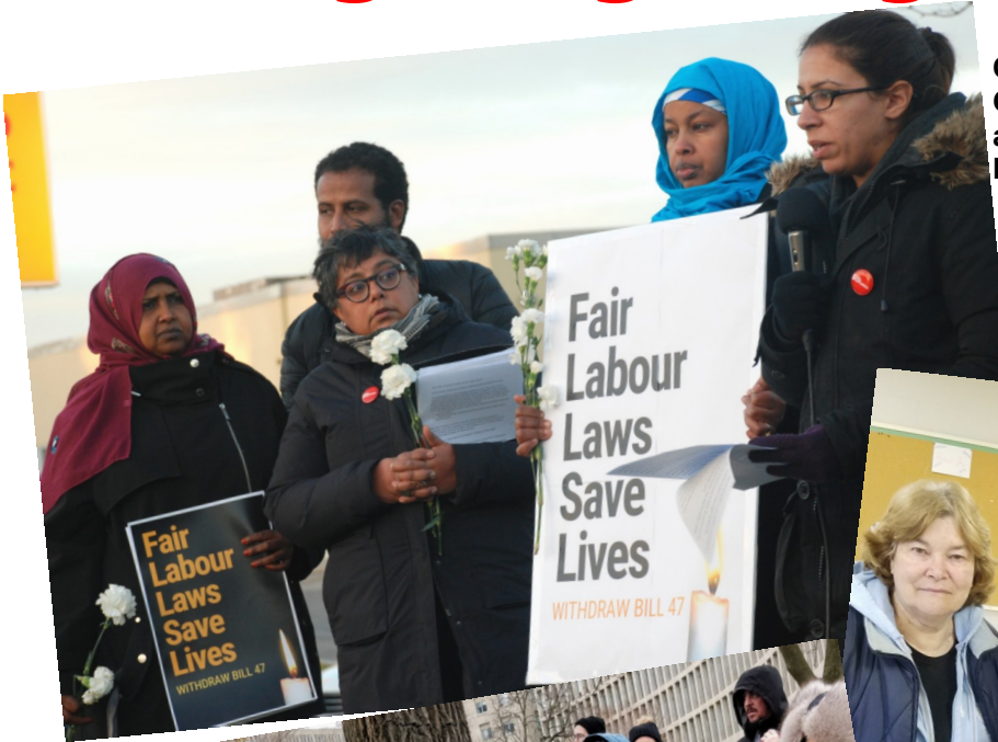
October 29, 2018: Community Vigil for a temp agency worker at Upper Crust Bakery who was killed on the job