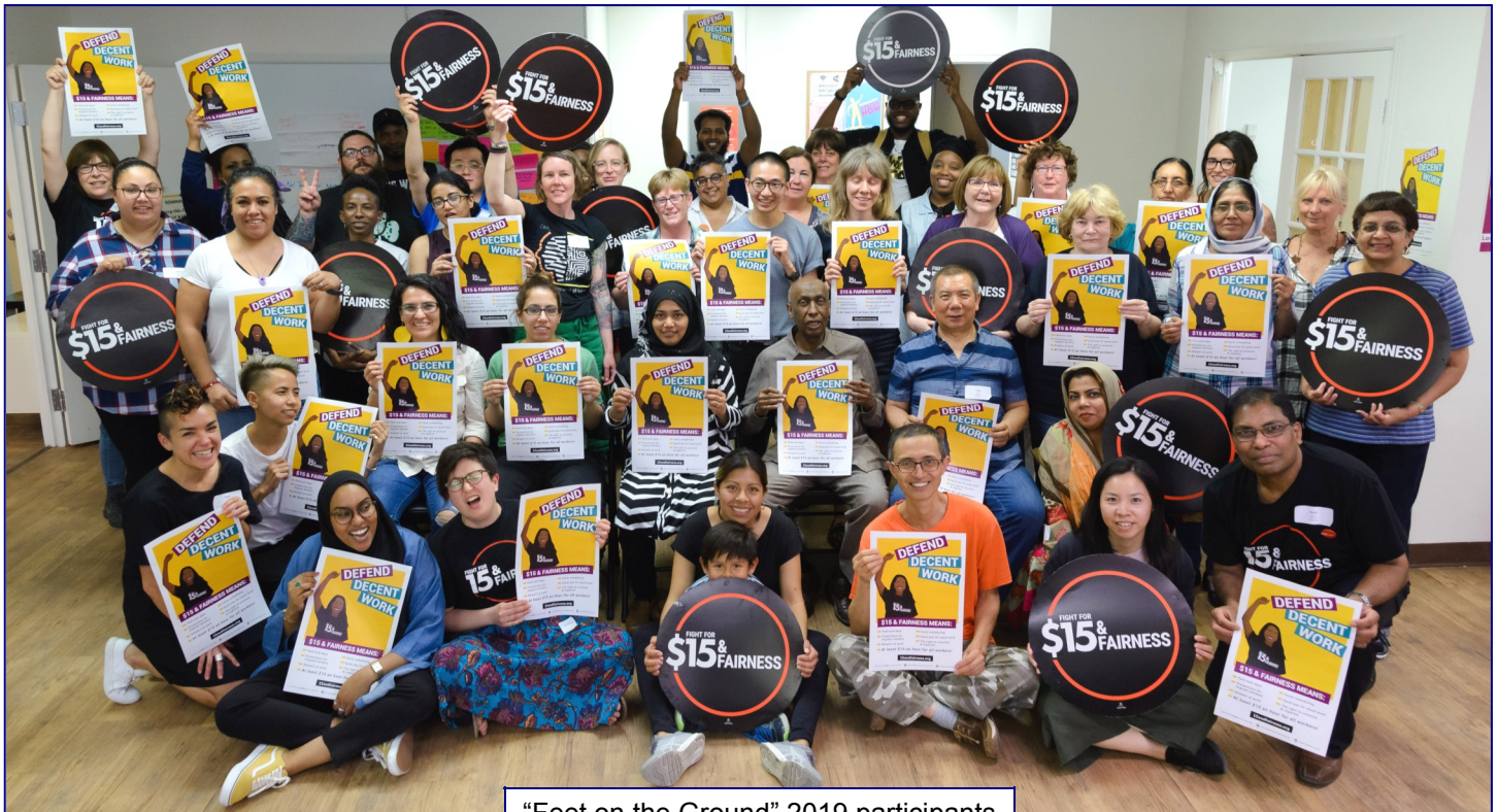
“Feet on the Ground” 2019 participants

This year, “Feet on the Ground” is bringing together a total of 34 worker leaders from 12 cities or towns (Bancroft, Bracebridge, Brampton, Hamilton, London, Markham, Mississauga, Niagara, Newmarket, North Bay, Ottawa, Trenton), 6 Toronto neighbourhoods (Eglinton West, South Etobicoke, North Etobicoke, North York, Scarborough, St. James Town, Victoria Park), 12 sectors (care work, cleaning, colleges, construction, education, factory work, grocery stores, healthcare, libraries, nail technicians, restaurants, universities), and 10 language communities (Arabic, Bengali, Cantonese, Hindi, Mandarin, Punjabi, Spanish, Somali, Urdu, Vietnamese). The diversity of participants has created a strong environment for cross-fertilization and shared learning.