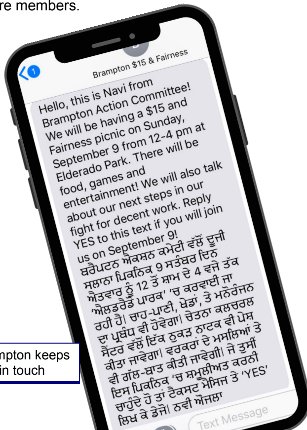
Brampton keeps in touch

Call Hub is another digital tool that has made it easier for us to connect with thousands of workers. By keeping track of the actions our supporters have taken in each neighbourhood, we can make sure that we are doing effective follow-up that keeps workers informed and engaged. Call Hub streamlines calls during our phone banks and allows us to digitally enter the replies and results of each phone call.