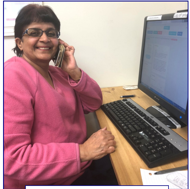
Phone banking with Call Hub

Phone banking is critical to our organizing! NationBuilder is a database tool that helps us keep track of $15 & Fairness supporters and comes in handy when we have hundreds of people to call. Leaders at the Workers' Action Centre use call sheets created through NationBuilder to invite workers to local events. We have found that it's a great way to bring out new people who are interested in becoming Workers' Action Centre members.