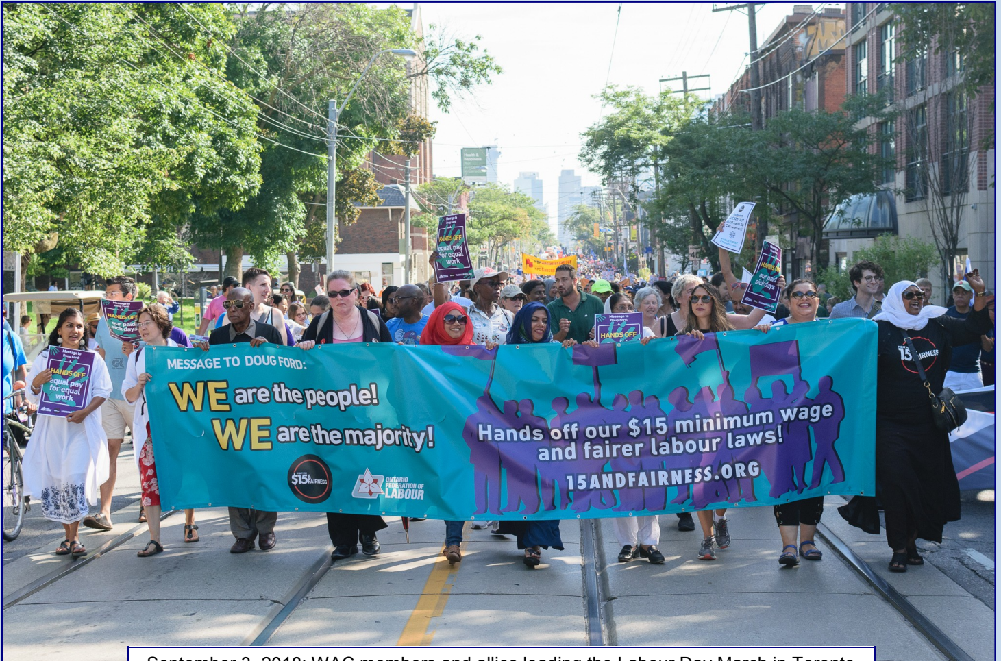
September 3, 2018: WAC members and allies leading the Labour Day March in Toronto

At Work, On the Streets, and In Our Communities