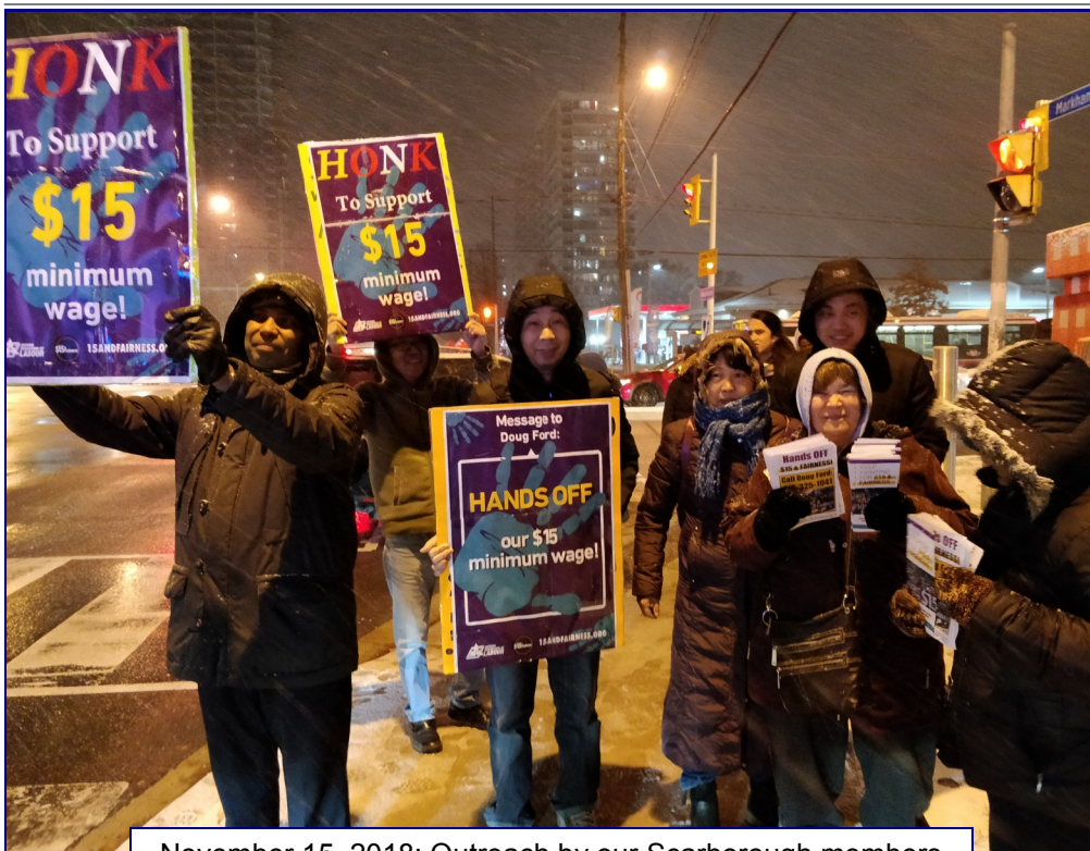
November 15, 2018: Outreach by our Scarborough members